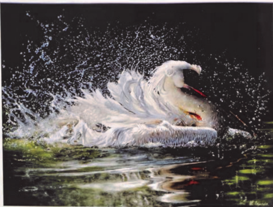
Le Bain, oil, 24 x 31.

How would you describe your style? My painting is not exactly a hyper-realistic style, although at first glance people may believe it is a photograph. But they discover little things that characterize a painting and not a photograph. What I like above all is the illusion.